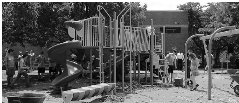
Volunteers assemble and secure the slide structure for the new playground at the Barclay Elementary/Middle School.