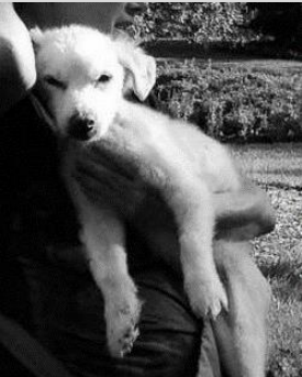
Hayley November 1997 - January 2015